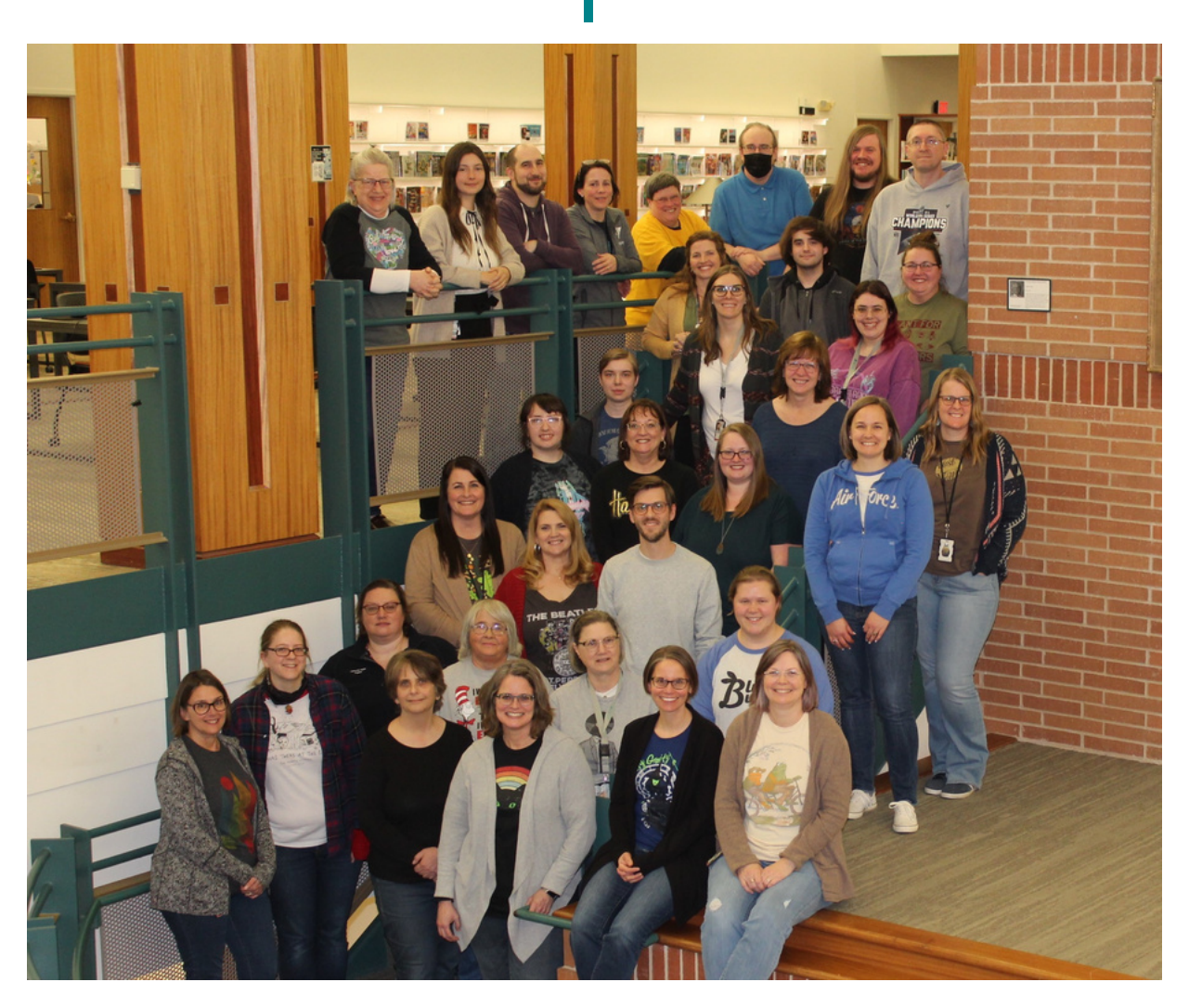
400 Willow Avenue Council Bluffs, IA 51503 www.councilbluffslibrary.org

The Council Bluffs Public Library: *Offers superior customer experiences *Encourages learning and discovery *Is inclusive and provides access to all *Cultivates collaboration and innovation *Believes in the freedom to know *Fosters a positive work environment *Provides wise stewardship of public resources